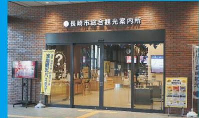
JR Nagasaki Station the tourist information office (Enter the east exit and turn left)