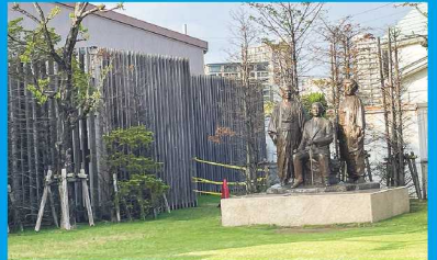
Matsugae International Cruise Ship Terminal outside building 2 in front of the statue of three people